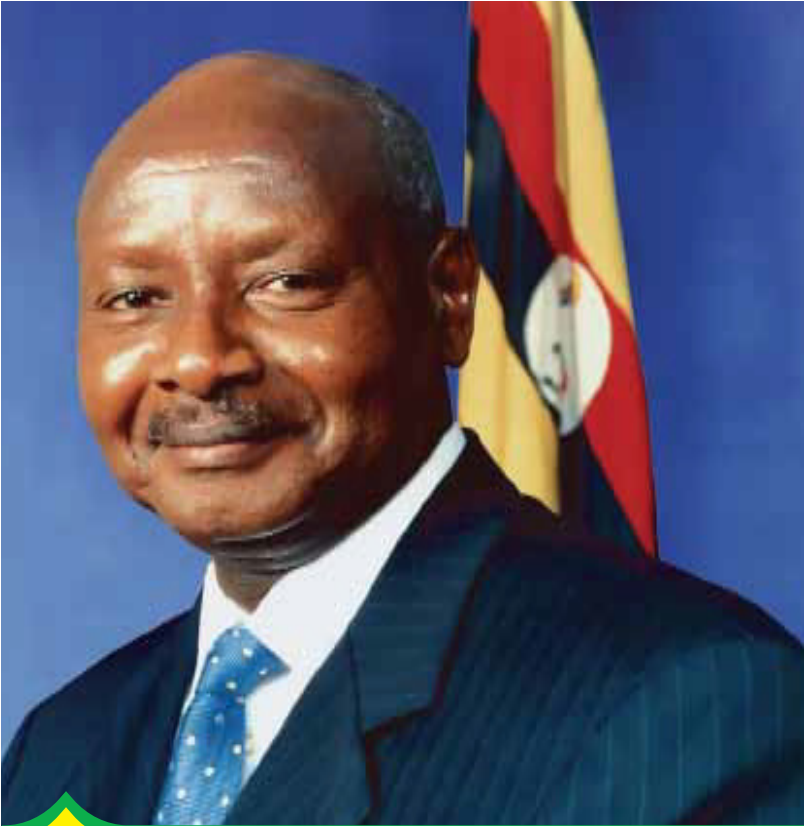
HIS EXCELLENCY, DR. GEN. YOWERI KAGUTA MUSEVENI