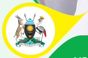
HIS EXCELLENCY, DR. GEN. YOWERI KAGUTA MUSEVENI