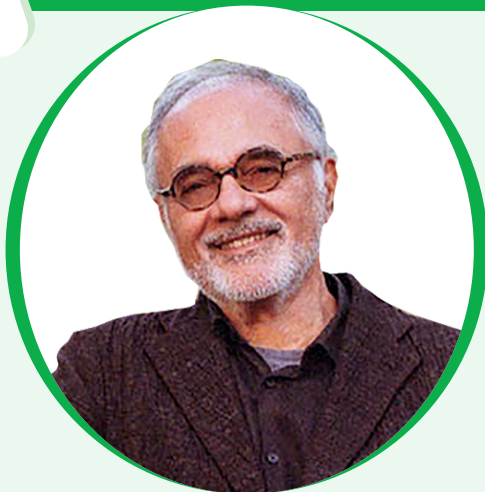
Prof. Mahmood Mamdani Chancellor